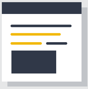
Misinformation (facts mixed with inaccuracies)

What you are reading might not be 100% fact-based, but: