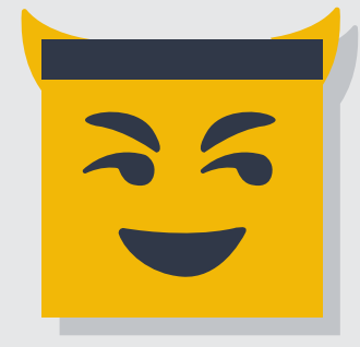
Fake news (Disinformation)